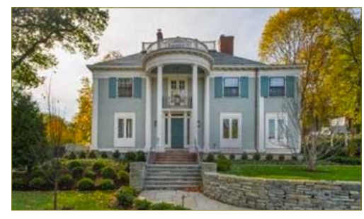
26 Weybridge Road