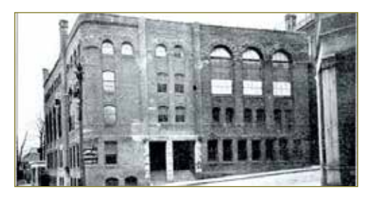
The Brookline Friendly Society

ed at the same time, and this not in a single town but in all towns, we suddenly outgrow our social clothes, and then we suffer from exposure," reported the Chronicle.