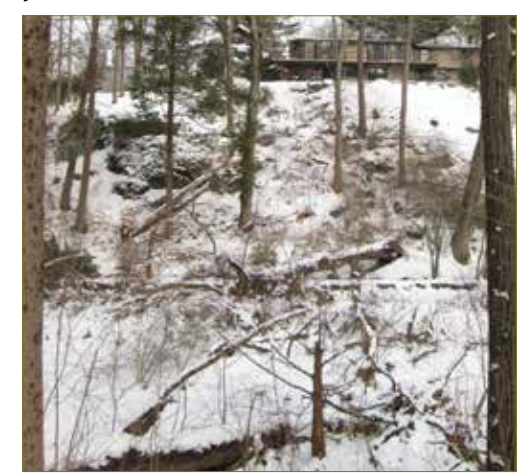
This recent photo shows the ravine where the cannonball was found, behind the Richardson and Hoppin houses.

When we are able to reopen the Devotion House in the future, we hope you will visit the cannonball and try lifting it yourself!