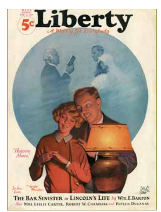
Liberty Magazine, Feburary 5, 1927

Evening Post. Subsequent Google searches produce assorted images of covers from the 1920s but none match the partial image sticking out from under the boy's arm. As any regular Googler has discovered, finding what you are looking for can require some experimentation with language. Finally, happening upon just the right search phrase leads to one of those treasure troves of information unimaginable before the development of the World Wide Web. A person with an evident passion for vintage magazines has collated every single issue of this magazine with photos of each cover along with detailed information on the cover artists, and the subjects and authors of every article. We have our answer: the boys are delivering the