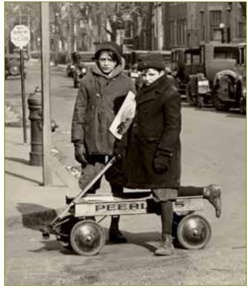
Paperboys and their Peerless wagon, 1927

Can we identify this magazine and what will it tell us about the story of the boys' Saturday? First up is Google to find out what magazines existed back in 1927. A simple search yields several promising names: Life Magazine, Liberty Magazine, the Saturday