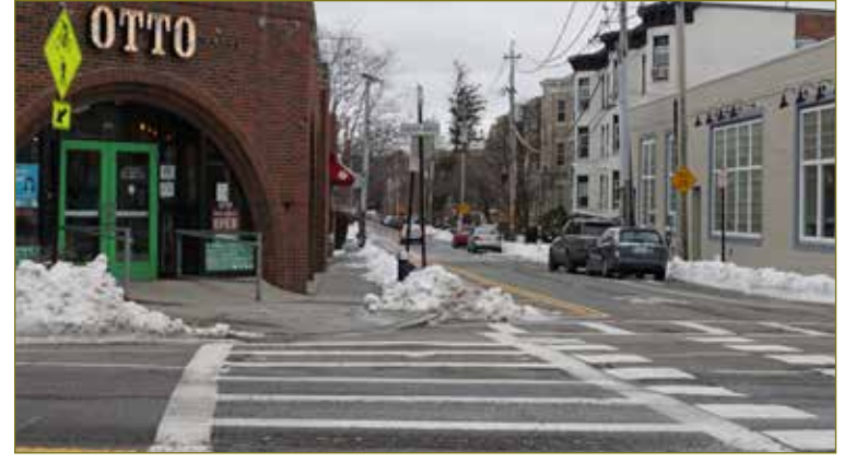
Corner of Harvard Street and Green Street-2021