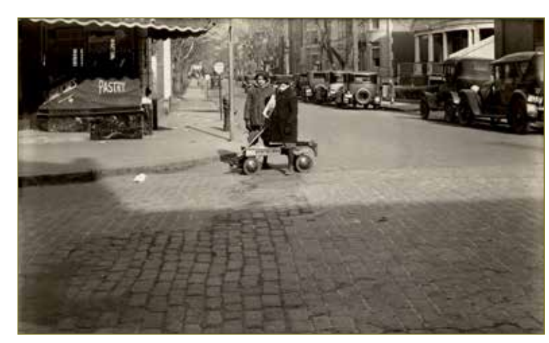
Corner of Harvard Street and Green Street-1927

The first mystery in the photo that catches our eye is the corner of a store and its "Pastry" sign. The detective process begins with a pro forma search of an atlas to determine the street address: 289 Harvard Street, at the corner of Green Street. A search of the 1927 Brookline town directory follows to determine the occupant: Gurley's Vienna Bakery. A deeper dig into the town directories will map out for us the history of the occupants of that address. (Directories from 1871 to 2016 are available and linked on our website under Research. Those with a subscription to the paid site ancestry.com can also access the 1868 directory). Some legwork with the directories