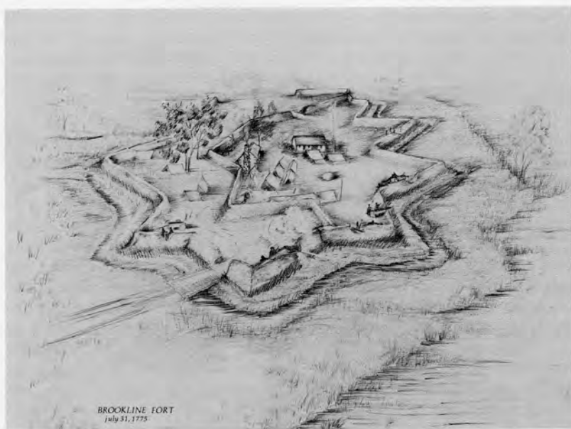
FIGURE 2. LINE DRAWING OF THE FORT

This modern-day artist's rendition of what the Brookline Fort may have looked like was done by Ric Cavazos.