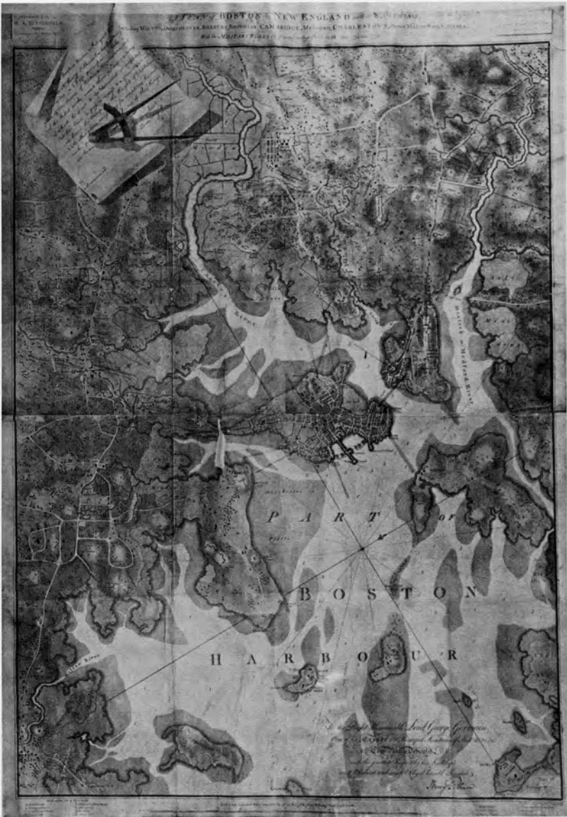
FIGURE I. MAP OF BOSTON IN 1776

This map by Henry Pelham shows the ring of fortifications around the Boston peninsula.